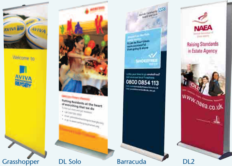
Grasshopper DL Solo Barracuda DL2

The range below is just a small selection of some of the products we have available, please call for further details, sizes, graphic options and prices. Costs shown are for one-offs, discounts are available for quantity pricing.